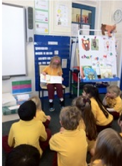
Read to the class