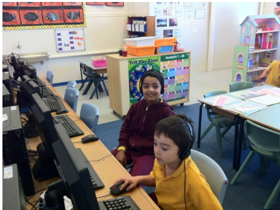
15 minutes computer time