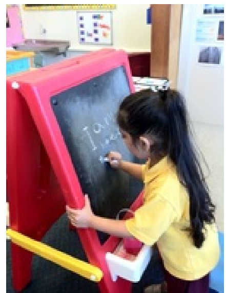
15 minutes free time