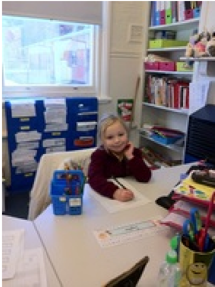
Sit at the teacher's desk

At the beginning of Term 3, K-2 classes introduced a new positive behaviour system. Students are rewarded with a level on "the beehive" when they demonstrate whole body listening and follow the school values. When they reach the 'top of the beehive', the students choose a reward and start all over again. It has been a great success! Here are some of the choices that students have made in Kindergarten.