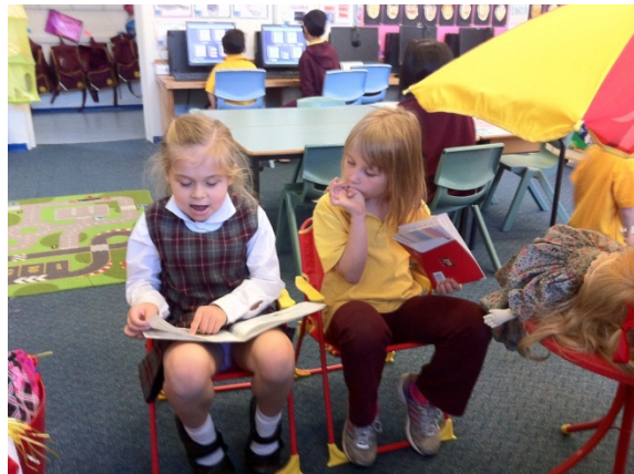
15 minutes reading in the book corner