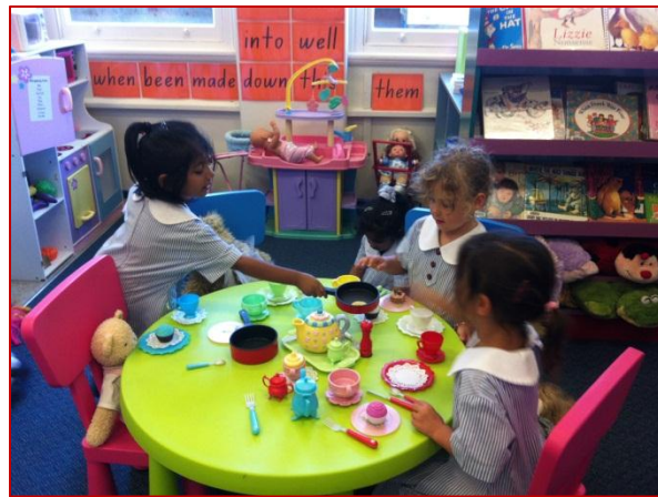
Literacy: Speaking & Listening