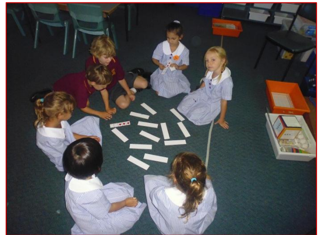
Mathematics: Numeracy groups